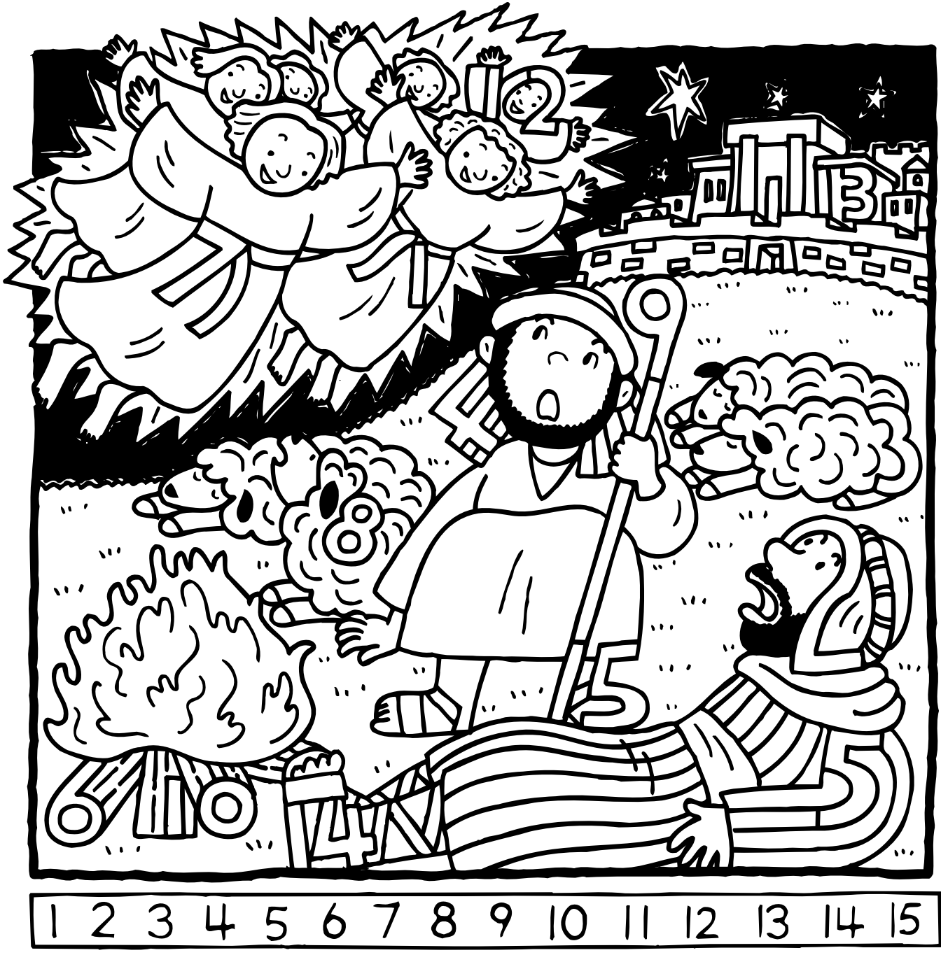
We can thank God that Jesus was born. Our Bible says, "It is good to give thanks to the Lord." (See Psalm 92:1.)

Find and color the numbers 1 to 15 hidden in the picture.